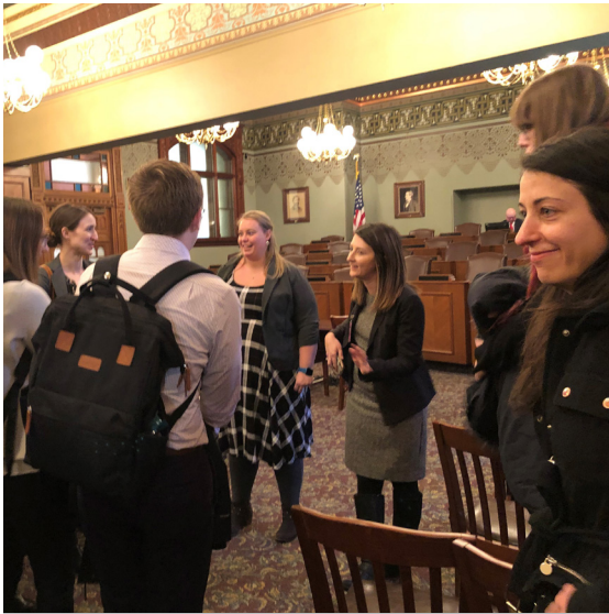
Students travel to the capital city for an experiential learning opportunity in legislation.

legislation to add a statutory provision on juvenile competency to stand trial, alternative school placement for students who have been expelled, and strengthening child representation for children in foster care. Clinic students also worked with youth in the child welfare system to develop and advance a legislative agenda on issues of concern for them.